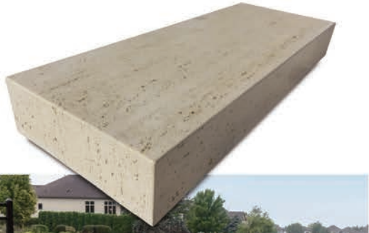
Step (Ivory or Natural)